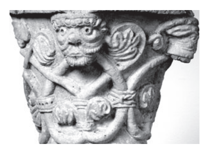
Nasher Museum, Duke University by The Duke

Confusion would be very easy at this point, for there are four masters who fit this description. One I have already described is the Duke Master whose tendrils emerge from the sides of the mouth and loop under the head to meet underneath [b1]. I have also described Félix whose tendrils flow the opposite way to each side where they scroll and loop in complex ways [b3]. The third I have only mentioned so far, is the Duchess whose arrangements are like Félix yet different in handling and artistry [b2]. Their templates are drawn schematically underneath.