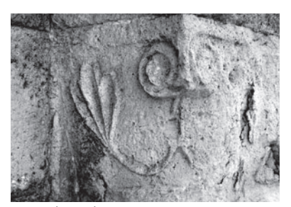
Bonneuil-en-Valois nave entry W.cR