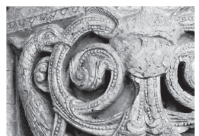
Bourges south portal by Félix