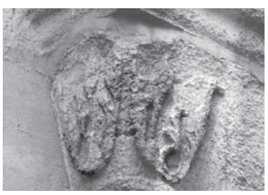
Auvers-sur-Oise north chapel window