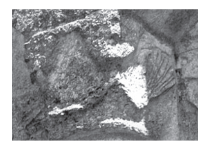
Oulchy-le-Château tower level 2