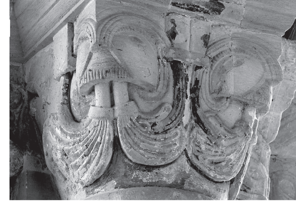
Morienval choir chapels