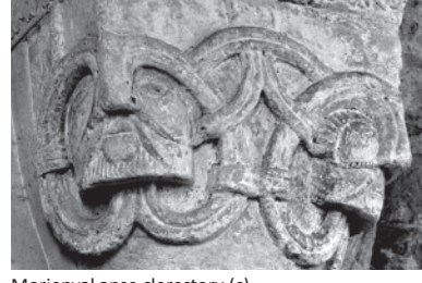
Morienval apse clerestory