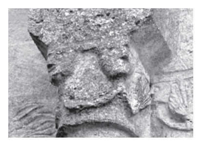
Oulchy-le-Château tower level 2