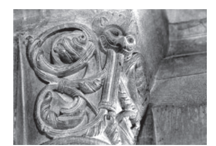
Poissy north aisle by The Duchess